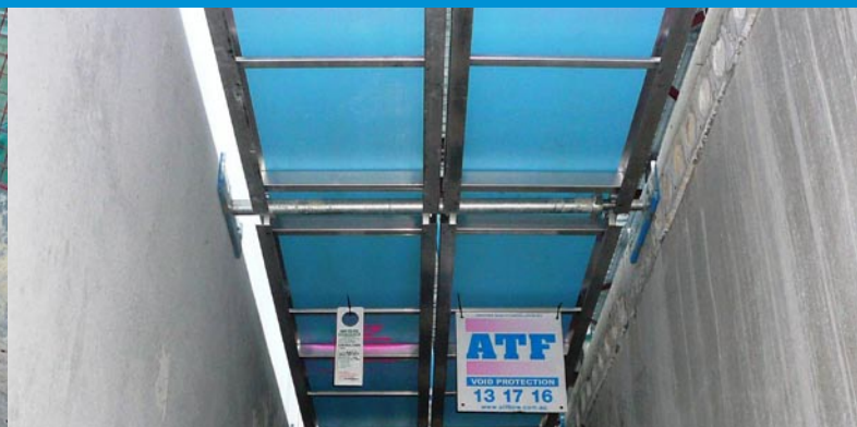
Concrete tilt panel